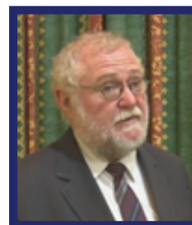
Key Note Speaker Hon. Calle Schlettwein Minister of Finance